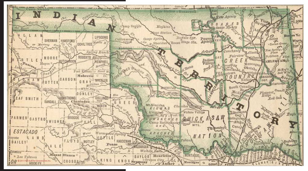
An 1884 map of Oklahoma

When the federal government removed the Cherokee tribe from southern Appalachia and, along the Trail of Tears, relocated them to the area that is now Oklahoma,